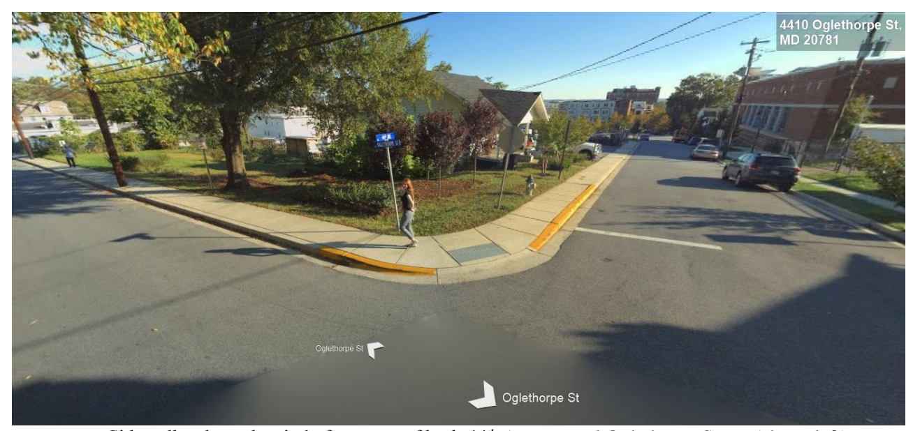
Sidewalks along the site's frontages of both 44<sup>th</sup> Avenue and Oglethorpe Street (above left) are immediately behind the curb and are obstructed by utility poles.